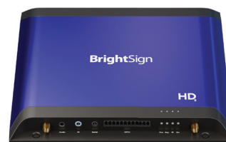
Expanded I/O Package