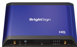
Standard I/O Package